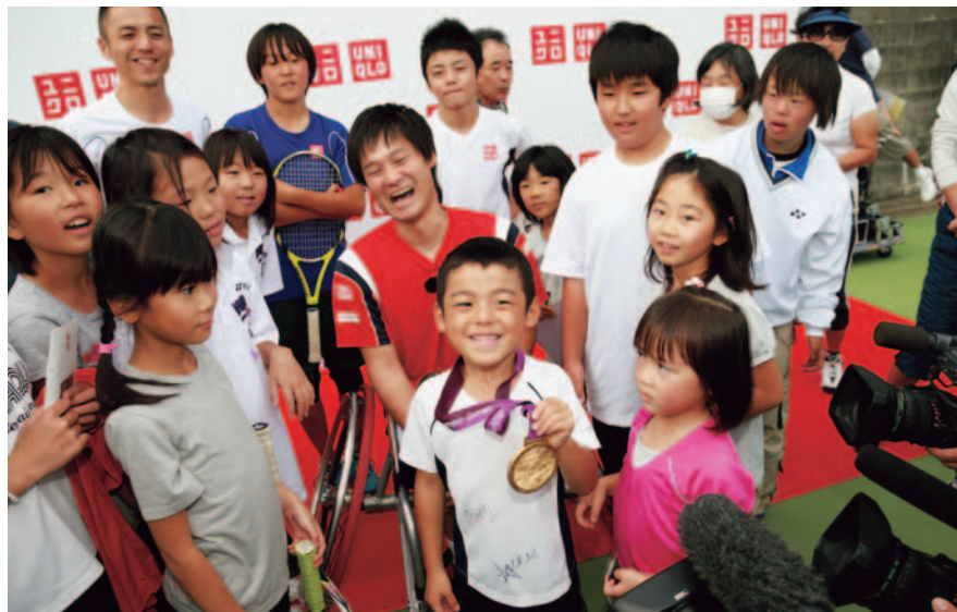
I visited Ishinomaki in Miyagi, Northeast Japan in the fall of 2012 as part of the ongoing UNIQLO Recovery Assistance Project from the March 2011 earthquake and tsunami. I hit some balls with children at the Ishinomaki Lawn Tennis Club and answered questions at the Kamo elementary school assembly. I can still hear the cheers and applause.

Spectators will be guaranteed some thrilling action at the 2020 Paralympic wheelchair tennis and my new dream is to fill the stands for every single match.