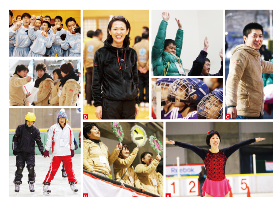
Vol. 01 | Spotlight on Employees with Disabilities