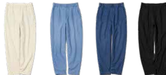
Denim Jersey Tapered Pants RM129.90

Get the look of authentic denim but with the comfort of stretch jersey material – available in natural denim hues.