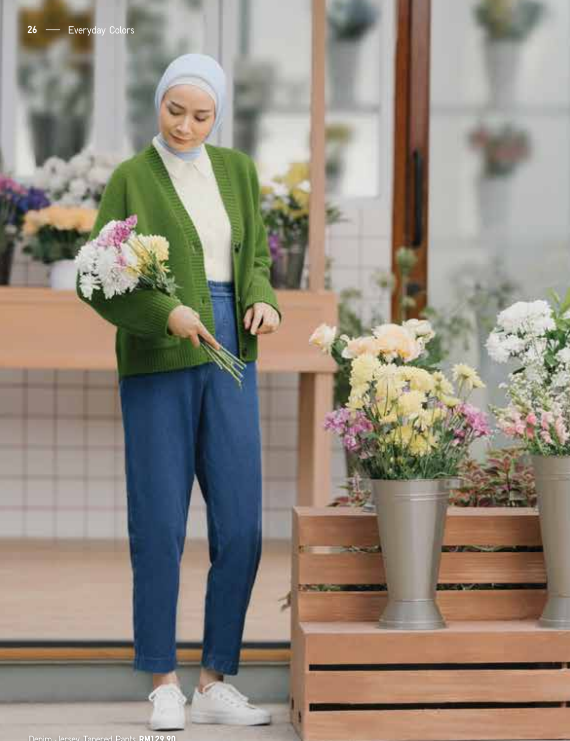
Denim Jersey Tapered Pants RM129.90 Light Souffle Yarn Short Long Sleeve Cardigan RM129.90 Extra Fine Merino Ribbed Polo Long Sleeve Cardigan RM149.90