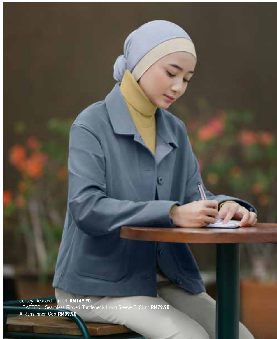
Jersey Relaxed Jacket RM149.90 HEATTECH Seamless Ribbed Turtleneck Long Sleeve T-Shirt RM79.90 AIRism Inner Cap RM39.90