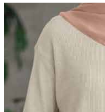
Waffle Crew Neck Long Sleeve T-Shirt RM79.90

A relaxed, easy t-shirt made with unique soft waffle fabric. Perfect to dress up or down.