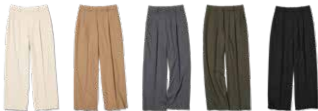
Pleated Wide Pants RM149.90

Make any clean or casual look perfect with versatile wide-cut pants in everyday colors.