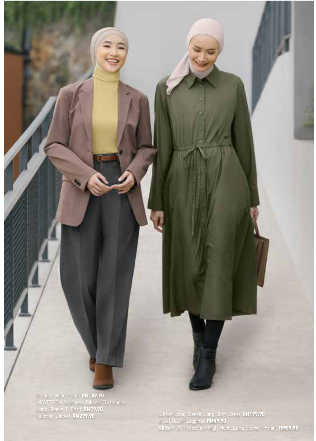
Pleated Wide Pants RM149.90 HEATTECH Seamless Ribbed Turtleneck Long Sleeve T-Shirt RM79.90 Tailored Jacket RM299.90

Make any clean or casual look perfect with versatile wide-cut pants in everyday colors.