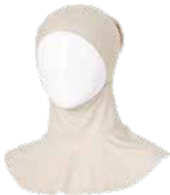
AIRism Inner Cap RM39.90