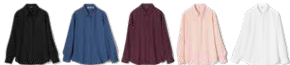
Rayon Long Sleeve Blouse RM129.90

Choose from any color of this silky rayon blouse to make any outfit more clean and sleek. Perfect for both weekdays and weekends.