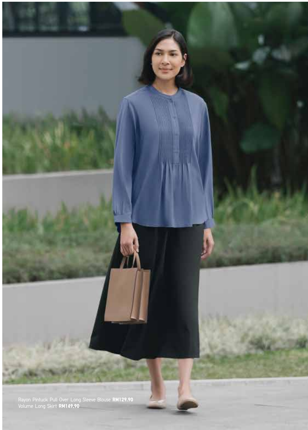
Rayon Pintuck Pull Over Long Sleeve Blouse RM129.90 Volume Long Skirt RM149.90

Choose from any color of this silky rayon blouse to make any outfit more clean and sleek. Perfect for both weekdays and weekends.