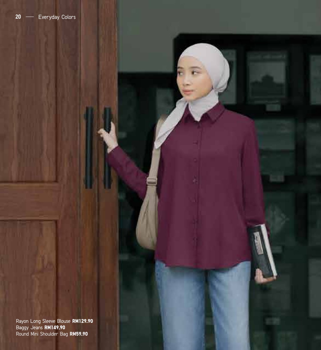
Rayon Long Sleeve Blouse RM129.90 Baggy Jeans RM149.90 Round Mini Shoulder Bag RM59.90