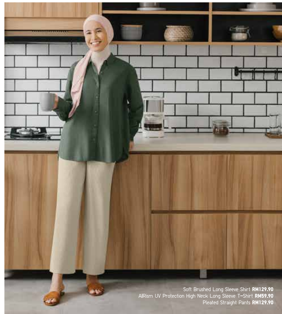
Soft Brushed Long Sleeve Shirt RM129.90 AIRism UV Protection High Neck Long Sleeve T-Shirt RM59.90 Pleated Straight Pants RM129.90