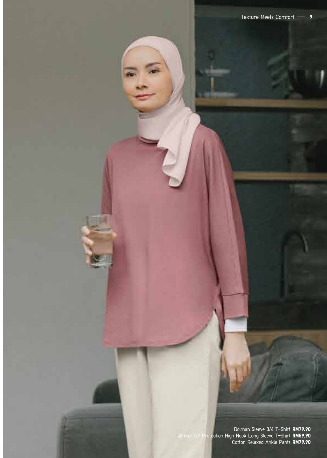
Dolman Sleeve 3/4 T-Shirt RM79.90 AIRism UV Protection High Neck Long Sleeve T-Shirt RM59.90 Cotton Relaxed Ankle Pants RM79.90

Relaxed silhouette pants with 100% cotton. Pairs well for any casual look.