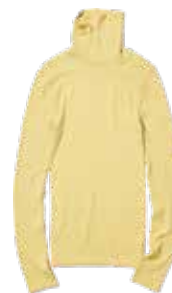
HEATTECH Seamless Ribbed Extra Warm T-Shirt RM79.90

Thin and lightweight, HEATTECH can sit easily under other layers. The innovative fabric keeps you warm with fibers that absorb heat released from the body.