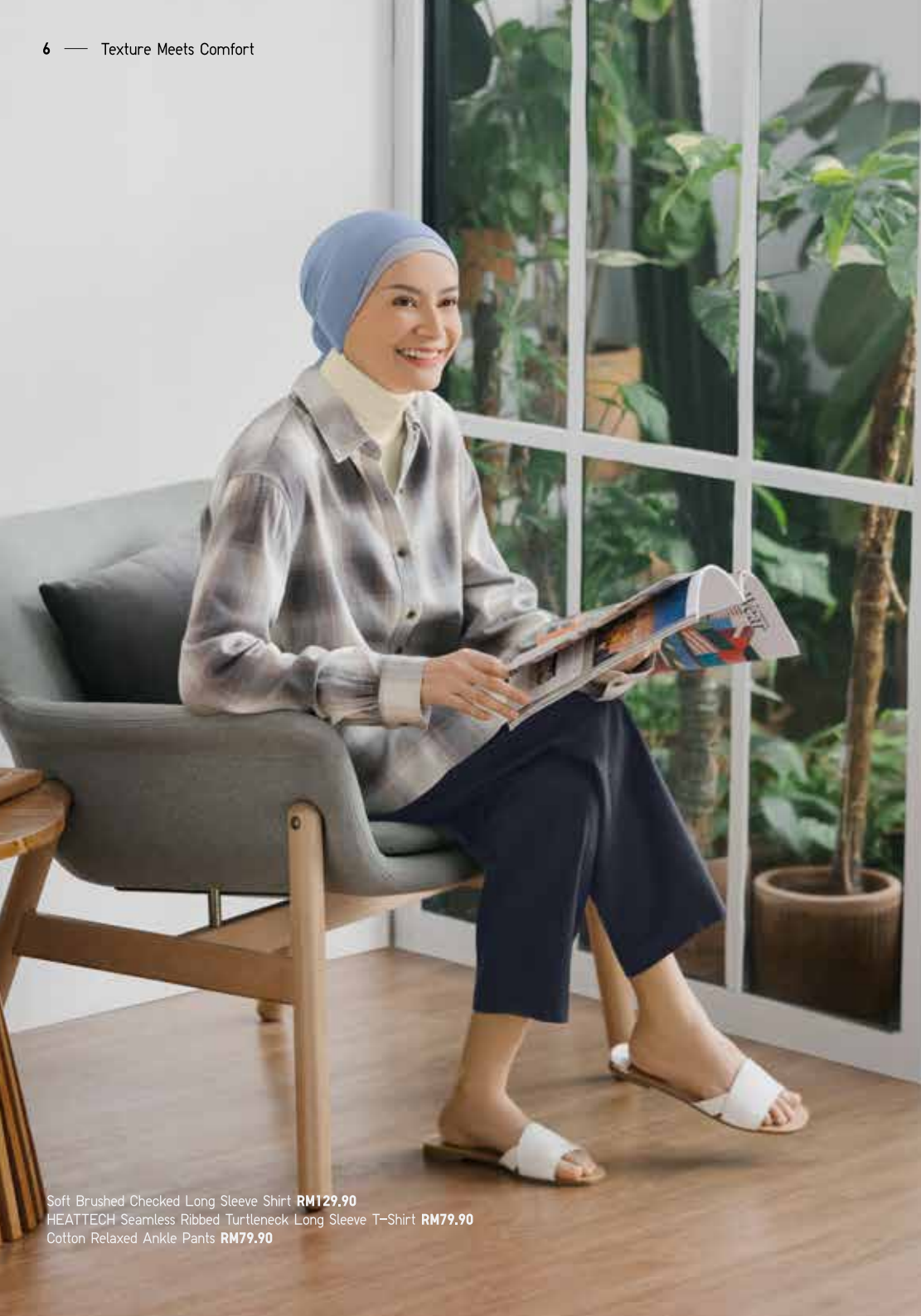
Soft Brushed Checked Long Sleeve Shirt RM129.90 HEATTECH Seamless Ribbed Turtleneck Long Sleeve T-Shirt RM79.90 Cotton Relaxed Ankle Pants RM79.90