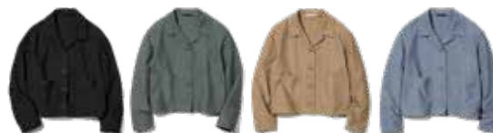
Jersey Relaxed Jacket RM149.90

A short, boxy silhouette jacket with soft jersey — pair any color for your modern city look.