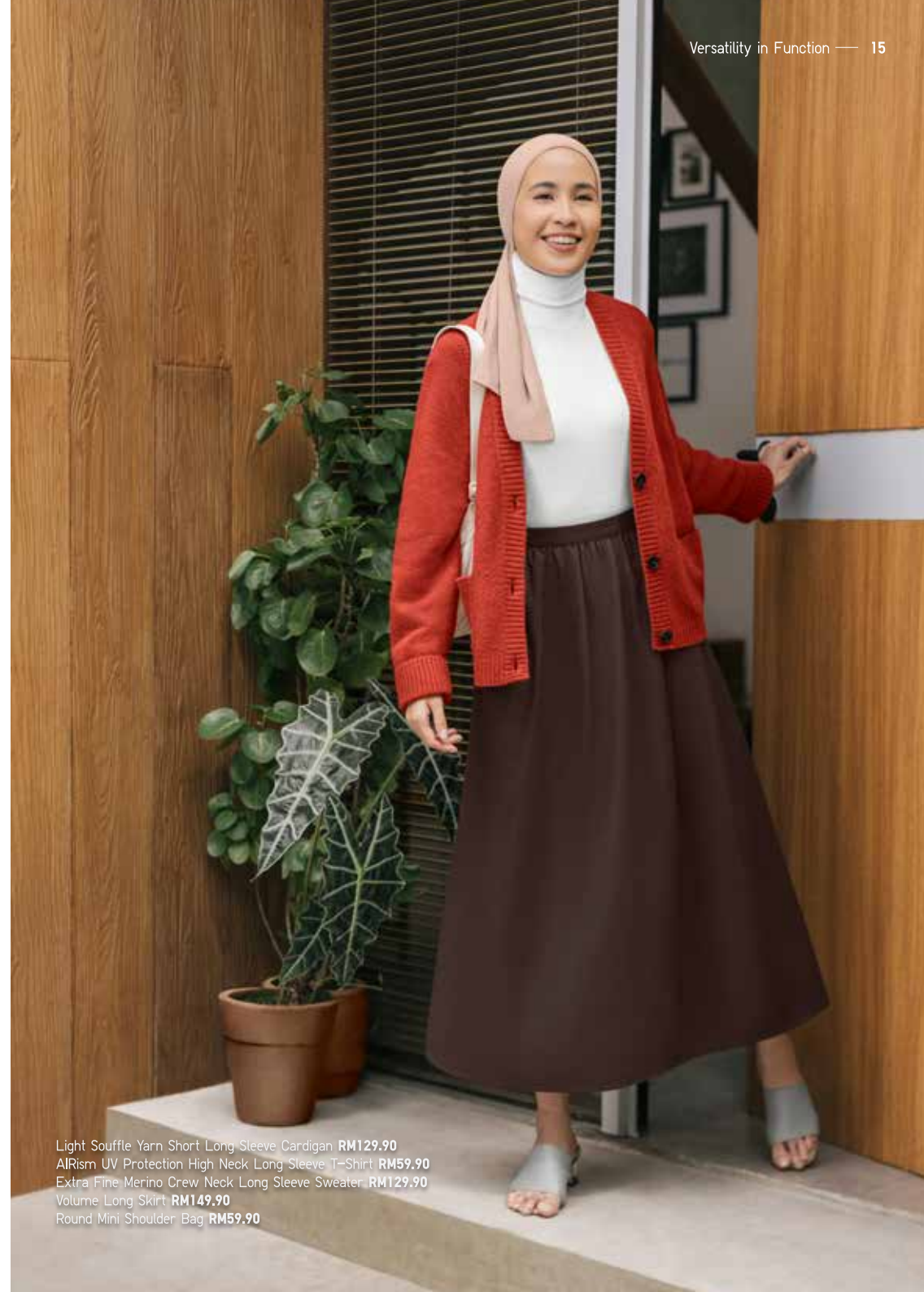
Light Souffle Yarn Short Long Sleeve Cardigan RM129.90 AIRism UV Protection High Neck Long Sleeve T-Shirt RM59.90 Extra Fine Merino Crew Neck Long Sleeve Sweater RM129.90 Volume Long Skirt RM149.90 Round Mini Shoulder Bag RM59.90