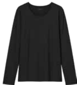
AIRism UV Protection Crew Neck Long Sleeve T-Shirt RM59.90