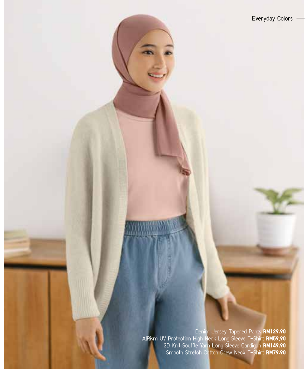
Denim Jersey Tapered Pants RM129.90 AIRism UV Protection High Neck Long Sleeve T-Shirt RM59.90 3D Knit Souffle Yarn Long Sleeve Cardigan RM149.90 Smooth Stretch Cotton Crew Neck T-Shirt RM79.90