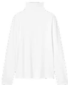
AIRism UV Protection High Neck Long Sleeve T-Shirt RM59.90

Lightweight and quick-drying, AIRism wicks away moisture and heat from skin to keep you fresh and dry during your busy day. Feels smooth and cool on the skin with high breathability.