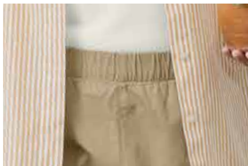
Cotton Relaxed Ankle Pants RM79.90

Relaxed silhouette pants with 100% cotton. Pairs well for any casual look.