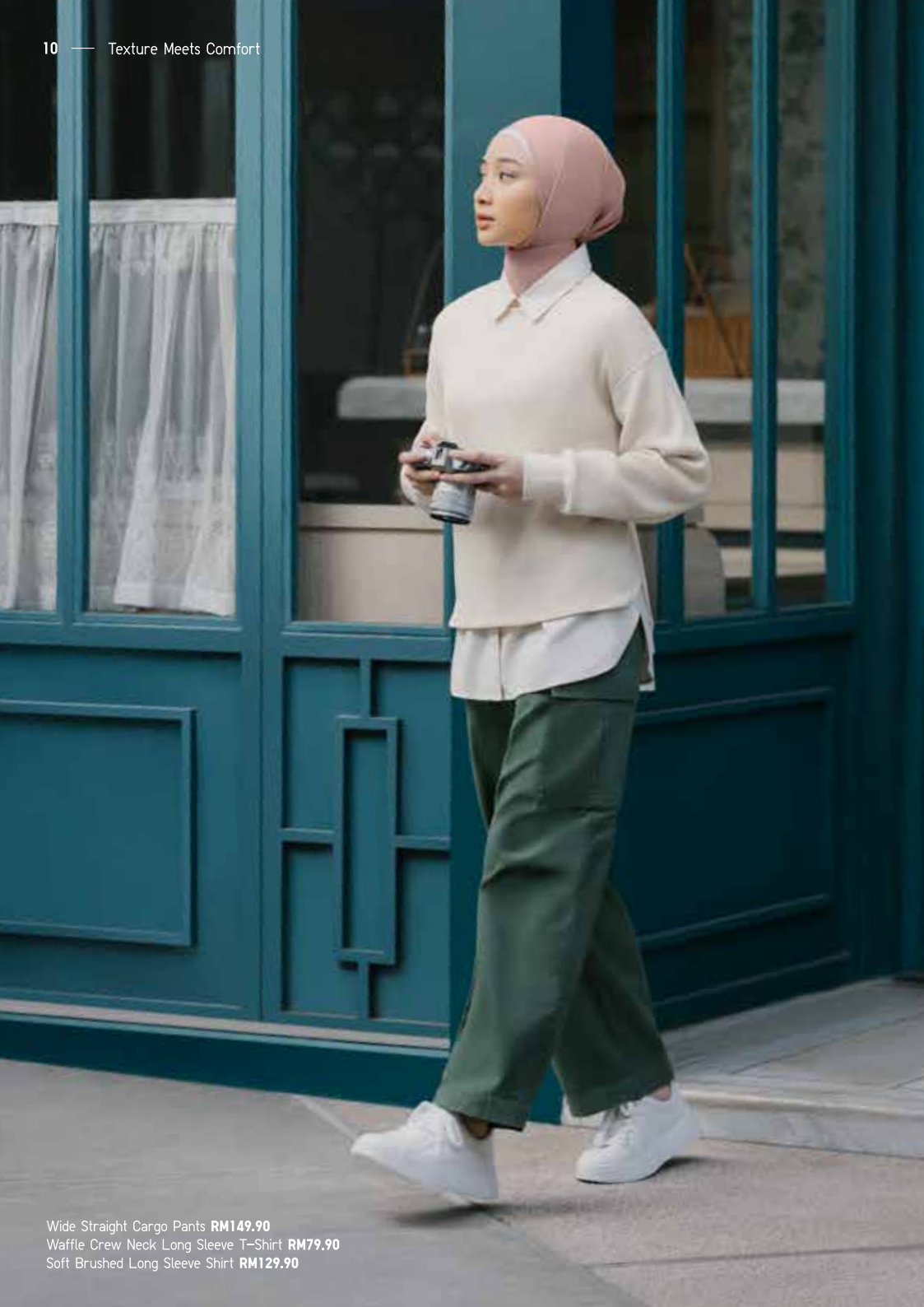
Wide Straight Cargo Pants RM149.90 Waffle Crew Neck Long Sleeve T-Shirt RM79.90 Soft Brushed Long Sleeve Shirt RM129.90