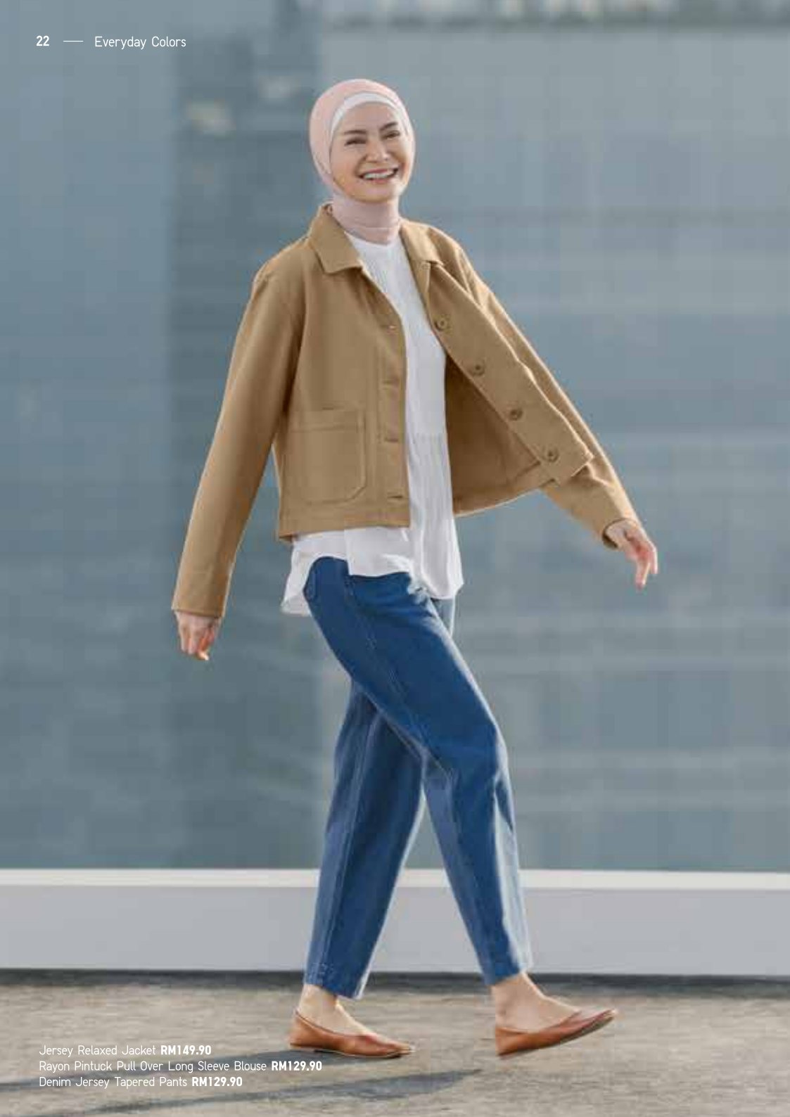
Jersey Relaxed Jacket RM149.90 Rayon Pintuck Pull Over Long Sleeve Blouse RM129.90 Denim Jersey Tapered Pants RM129.90