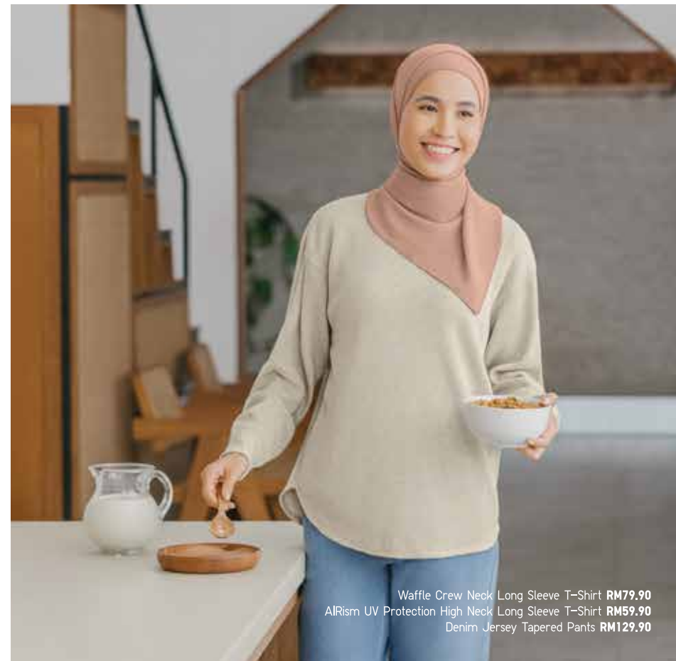
Waffle Crew Neck Long Sleeve T-Shirt RM79.90 AIRism UV Protection High Neck Long Sleeve T-Shirt RM59.90 Denim Jersey Tapered Pants RM129.90