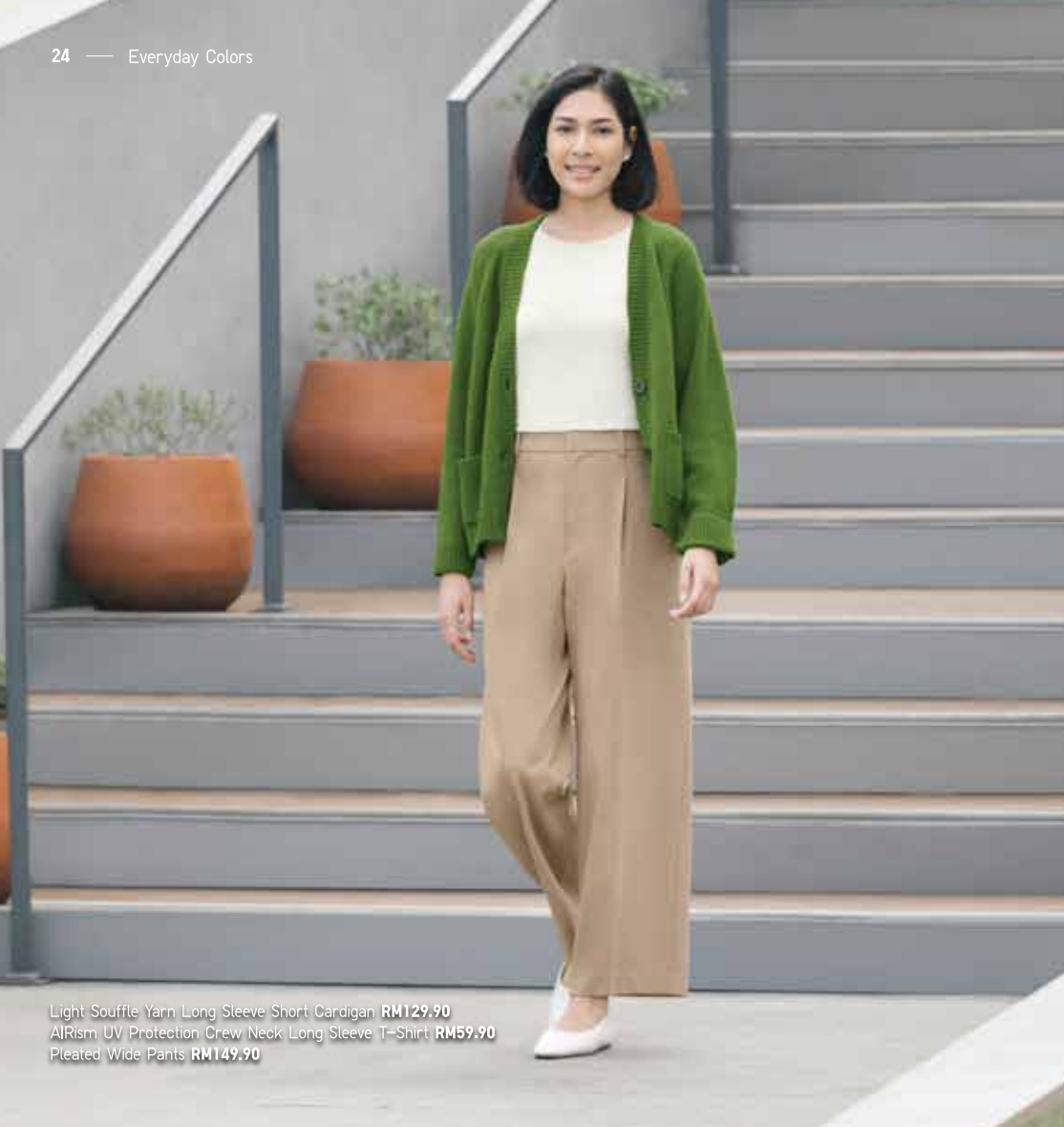
Light Souffle Yarn Long Sleeve Short Cardigan RM129.90 AIRism UV Protection Crew Neck Long Sleeve T-Shirt RM59.90 Pleated Wide Pants RM149.90