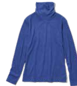
HEATTECH Fleece Turtleneck Long Sleeve T-Shirt RM59.90