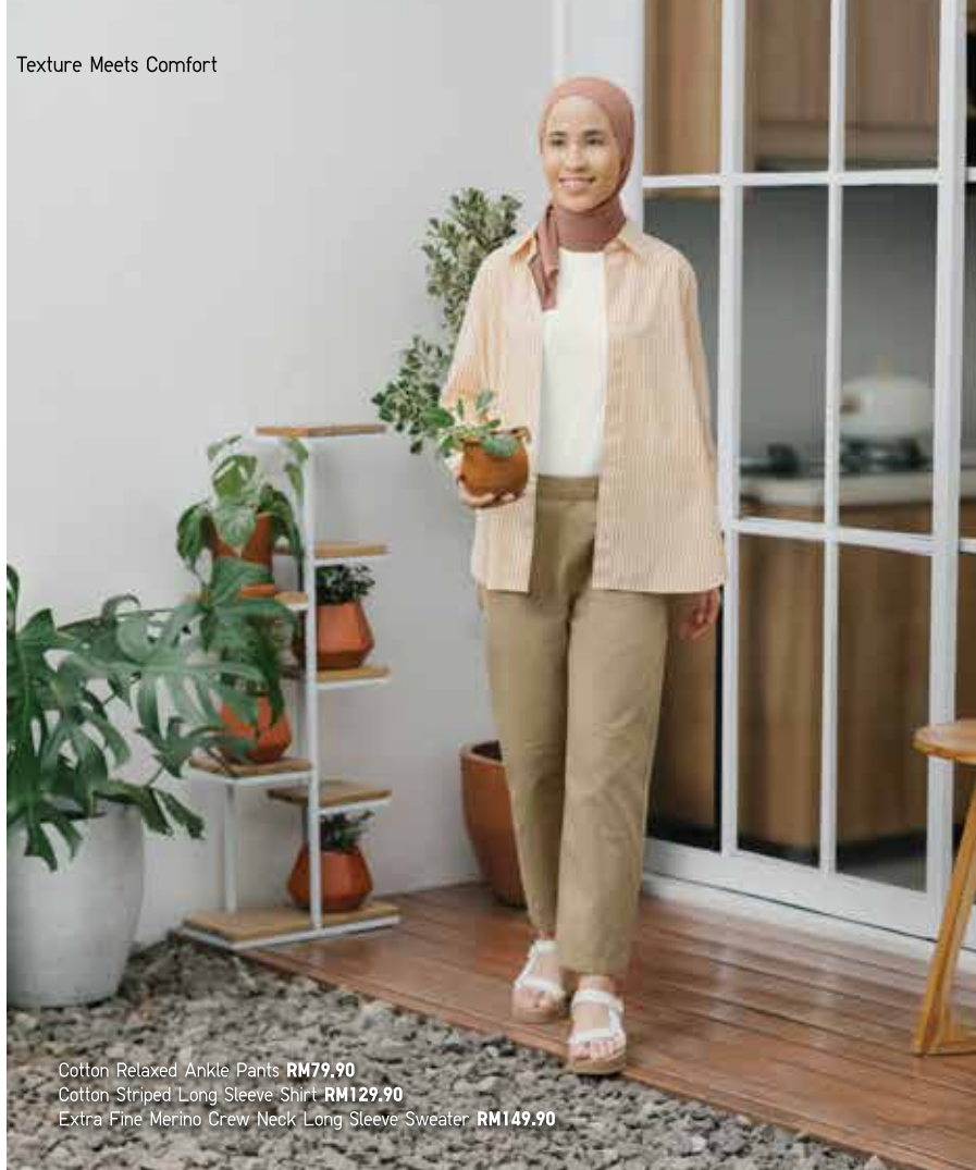
Cotton Relaxed Ankle Pants RM79.90 Cotton Striped Long Sleeve Shirt RM129.90 Extra Fine Merino Crew Neck Long Sleeve Sweater RM149.90