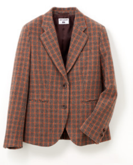
colors brightens up your winter days.