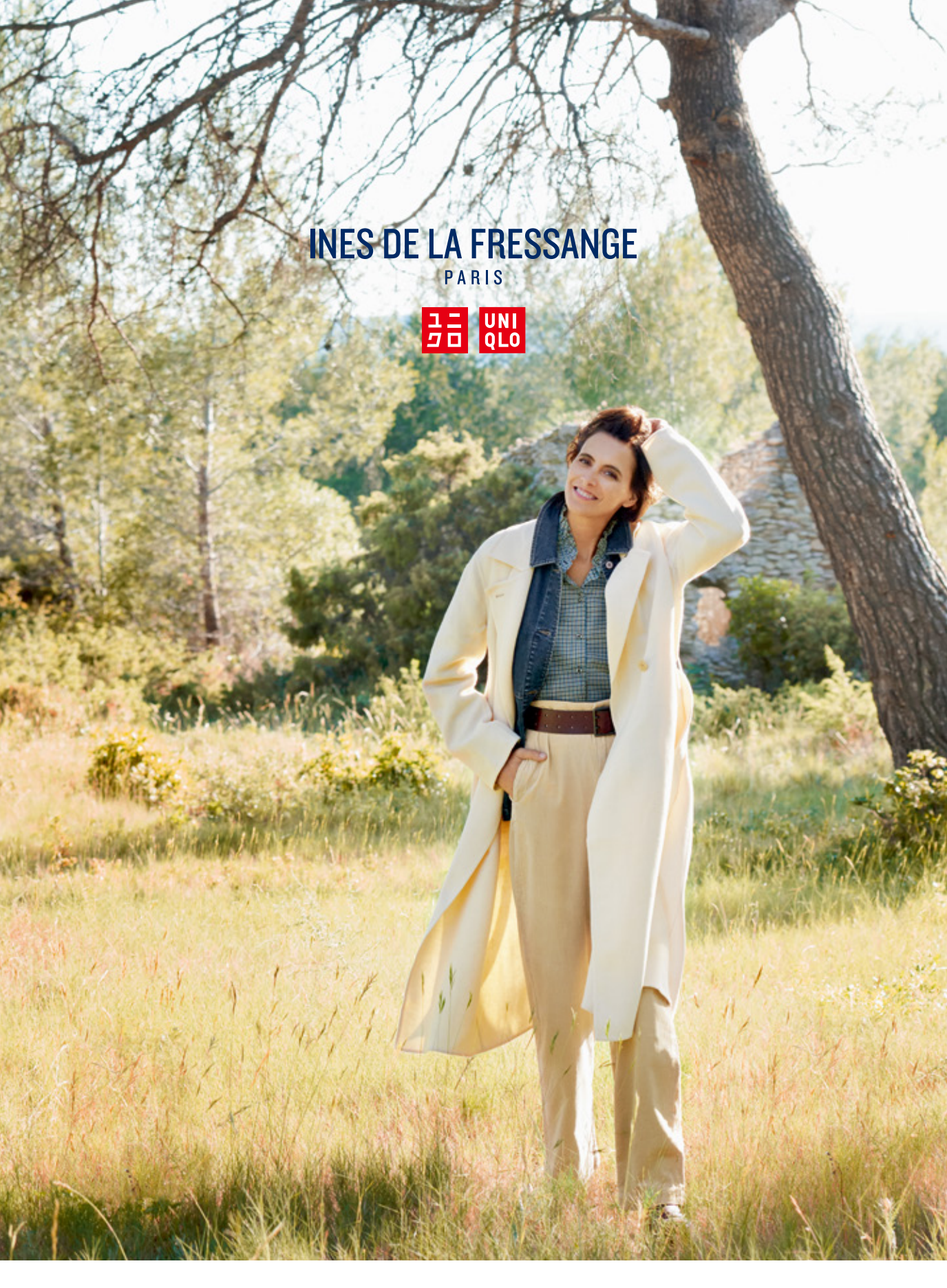
2020 Autumn/Winter COLLECTION