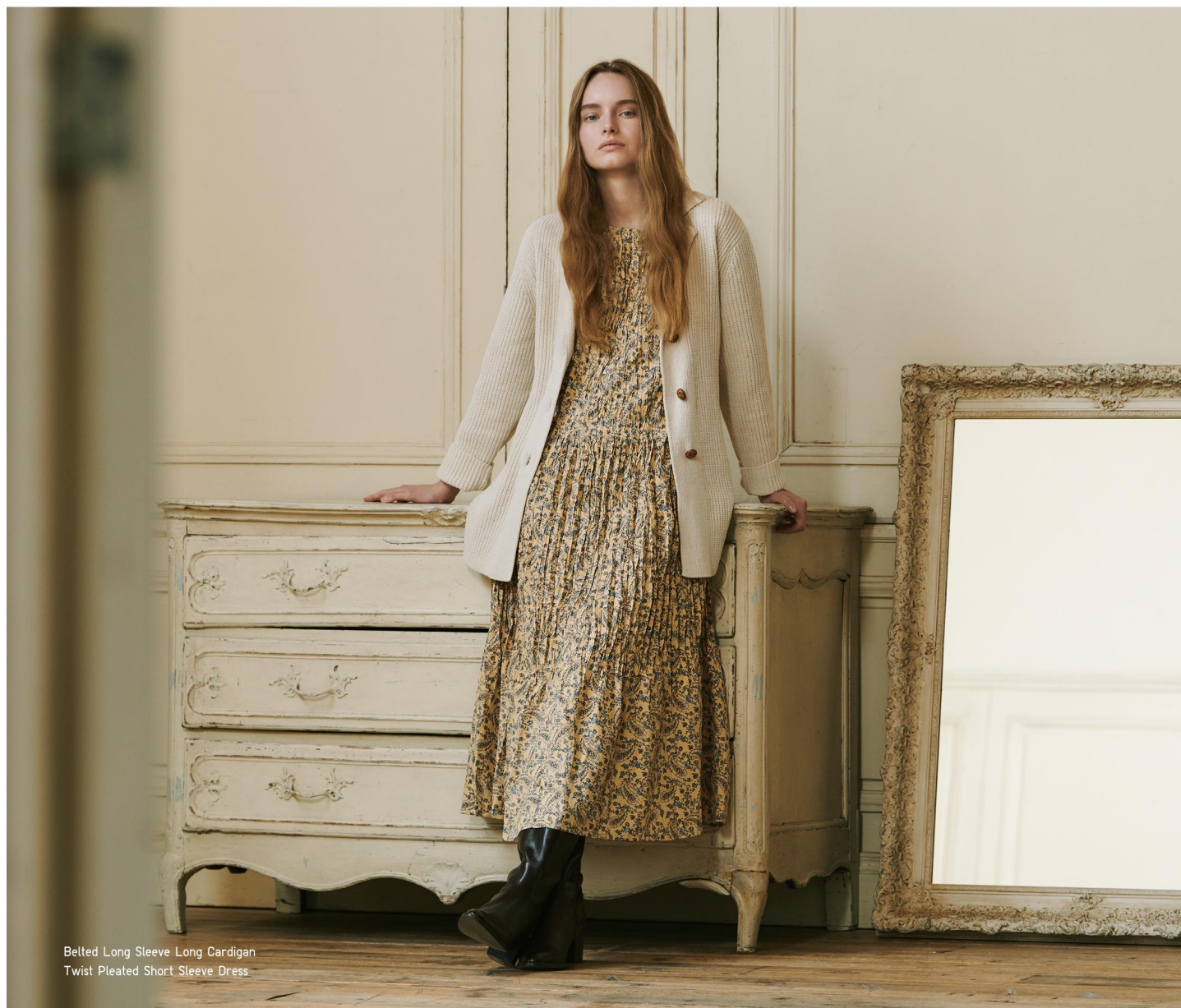
Belted Long Sleeve Long Cardigan Twist Pleated Short Sleeve Dress