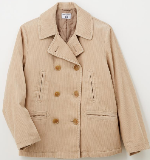
Corduroy Pea Coat