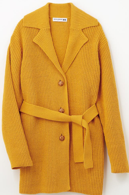
Belted Long Sleeve Long Cardigan