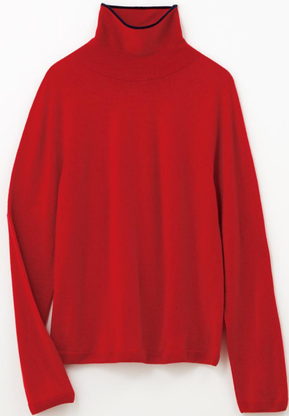
3D Knit Extra Fine Merino Turtleneck Long Sleeve Sweater