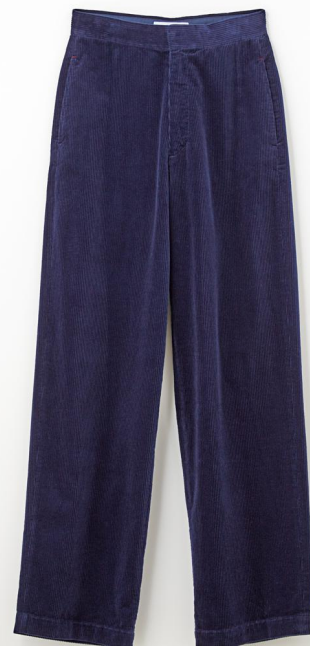
Corduroy Wide Pants