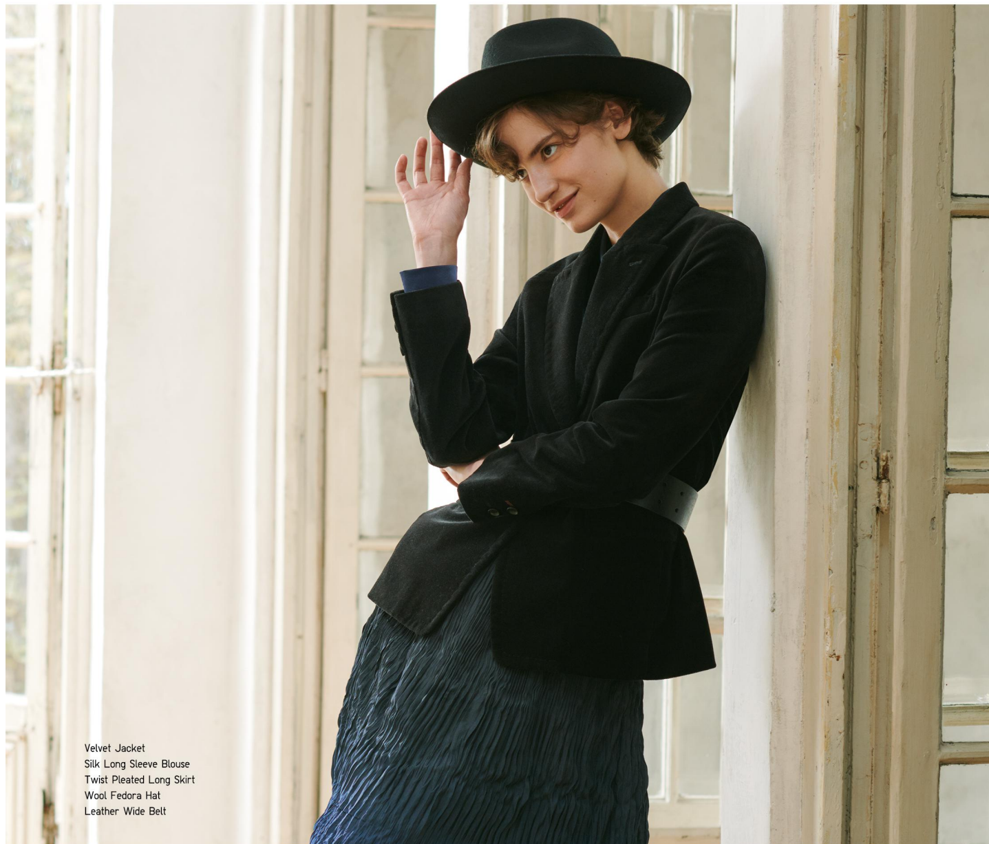
Velvet Jacket Silk Long Sleeve Blouse Twist Pleated Long Skirt Wool Fedora Hat Leather Wide Belt

“Among the many items in this collection, a dress and a jacket are the must-haves. These two items will bring a graceful look to your casual wardrobe.”