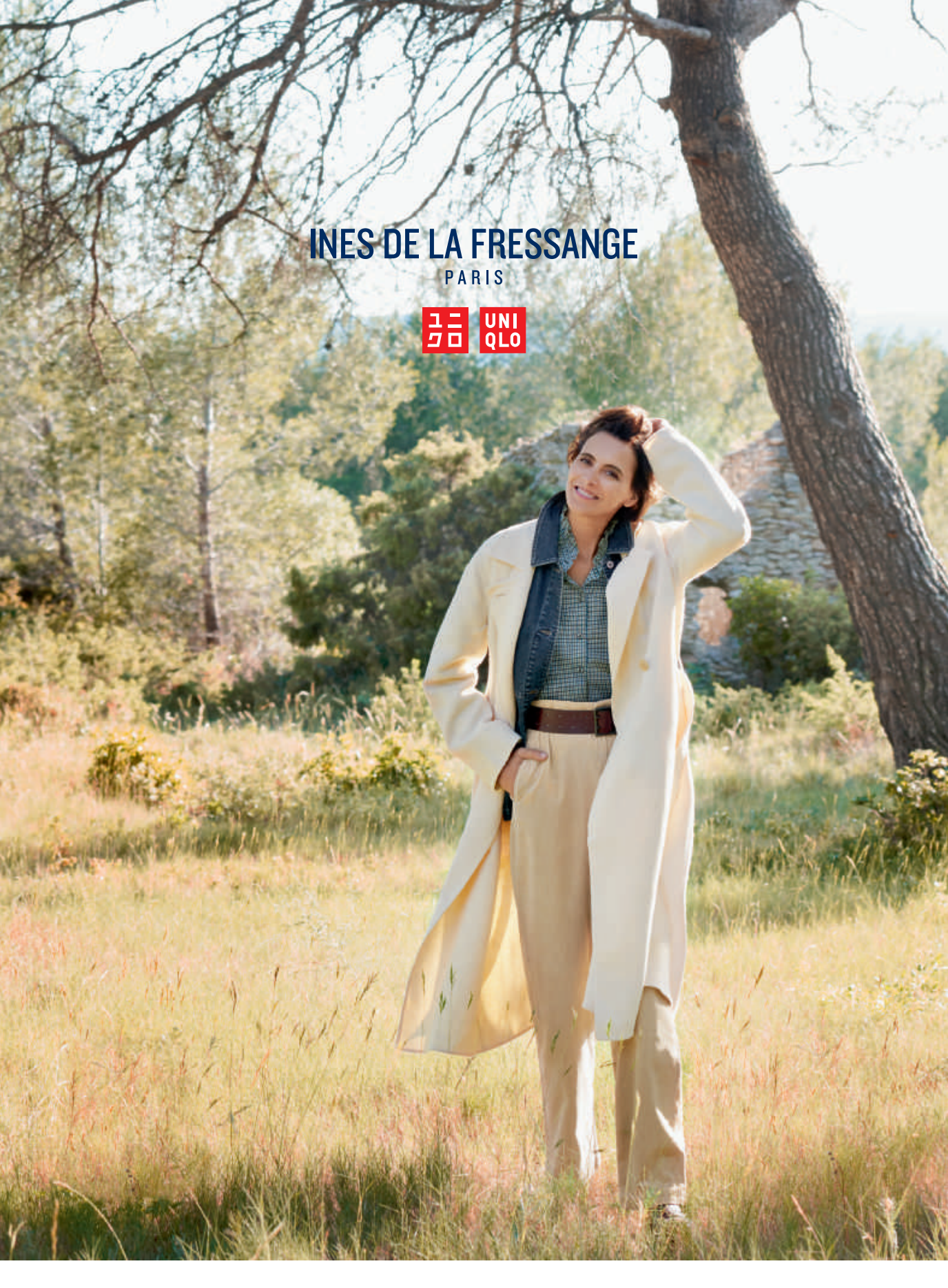
2020 Autumn/Winter COLLECTION